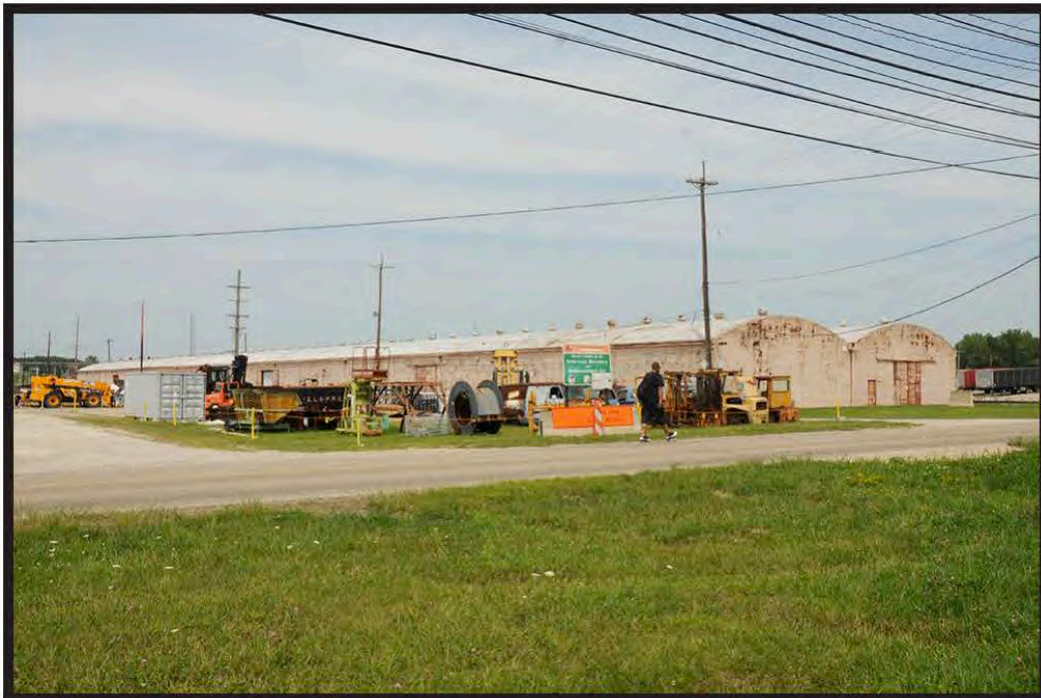
Figure 3: South Side of the X-744H Bulk Storage Building, August 2014, Facing Northeast