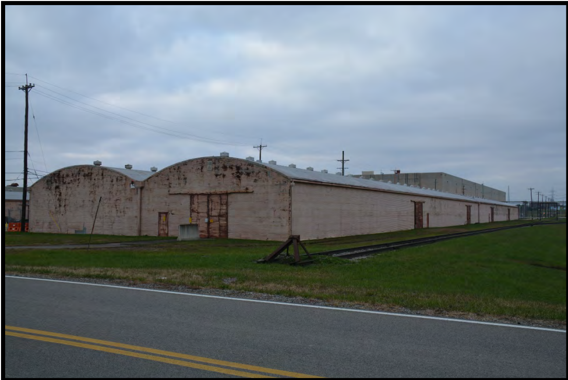
Figure 4: South Side of the X-744H Bulk Storage Building, November 2017, Facing Northwest