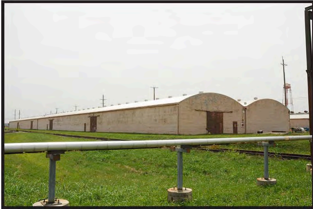
Figure 2: North Side of the X-744h Bulk Storage Building, August 2014, Facing Southwest