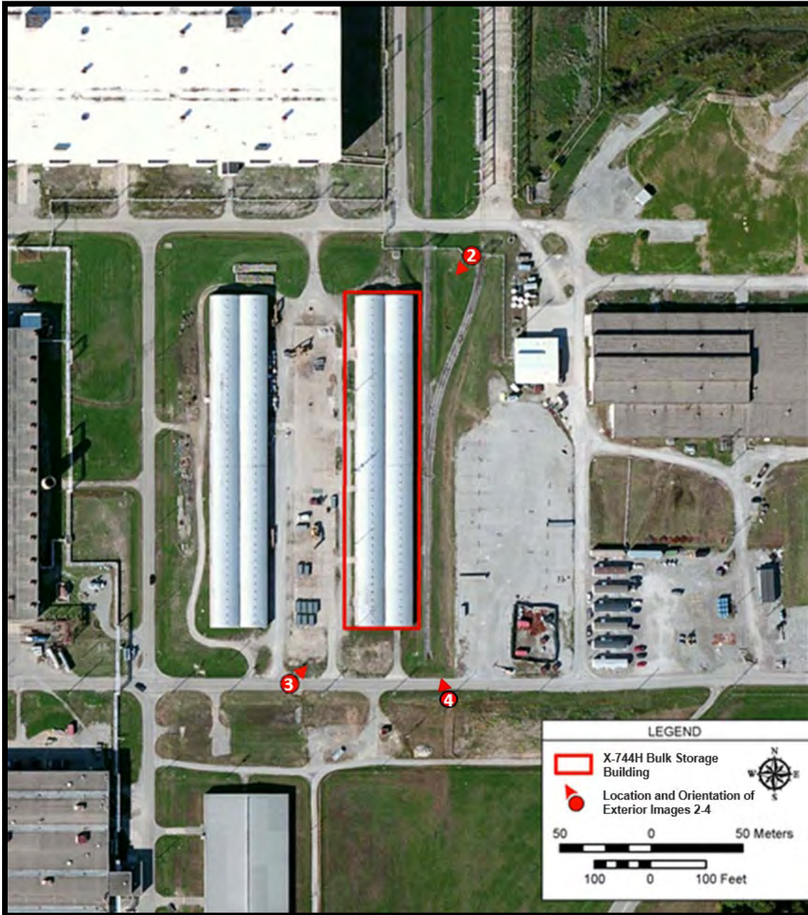
Figure 1: Location and Orientation of Exterior Photographs (2 through 4)