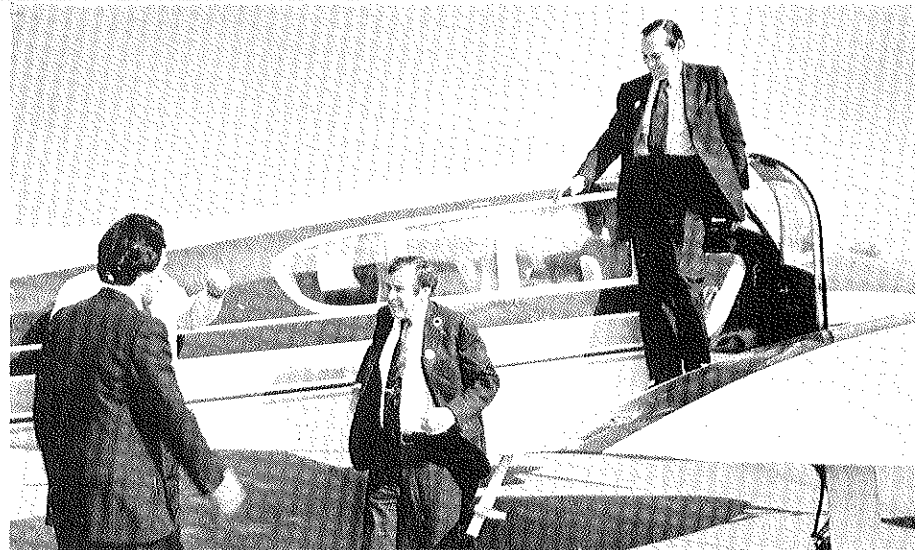
Senator Robert Taft, right, and Senator Howard Baker arrive for Plant visit.